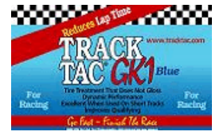
Track Tac® GK1-Blue

For a controlled drop of 5 to 10 points on the durometer. The right choice when the dew falls