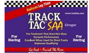
Track Tac® SAA-Grape

For use as a base coat to give a softer tire. Excellent on true dirt tracks. Can be used in cold weather.