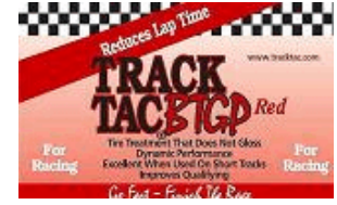
Track Tac® BTGP-Red

For Wet Tracks. Can be used as a base or at the track.